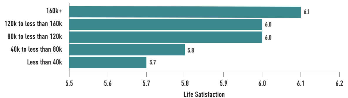
Figure 3. Relationship between Income and Average Life Satisfaction