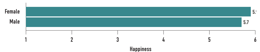
Figure 1. Gender Differences in Average Happiness

Respondents with a college degree or more education reported higher life satisfaction compared to people without a college degree.